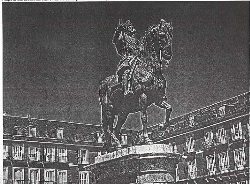
Felipe III sits astride his stallion as the centerpiece of Plaza Mayor.

Guided visit to Versailles • Step back into le grand siècle as you experience the opulence of Versailles, the elaborate palace of Louis XIV. Built to be the envy of all Europe, France's most extravagant chateau continually threatened to bankrupt the national treasury. Here the Sun King held court in the most lavish style imaginable. At one point, 1,000 nobles were attended by 4,000 servants inside the palace, while 15,000 soldiers and servants inhabited the annexes. Stroll through the elegantly landscaped gardens, designed by André Le Nôtre. You'll also tour the State Apartments of the King himself and walk through the historic Hall of Mirrors, where France, Spain and England officially recognized the independence of the United States in 1783, and where the Treaty of Versailles, which ended WWI, was signed. You'll also witness the ornate decor of the Queen's State Apartments, furnished for Marie Antoinette. (Because of the extreme popularity of Versailles, guided visits of the interior cannot be guaranteed during peak seasons. In this case, your group will hear a presentation from your guide before entering the palace.) On Mondays and other