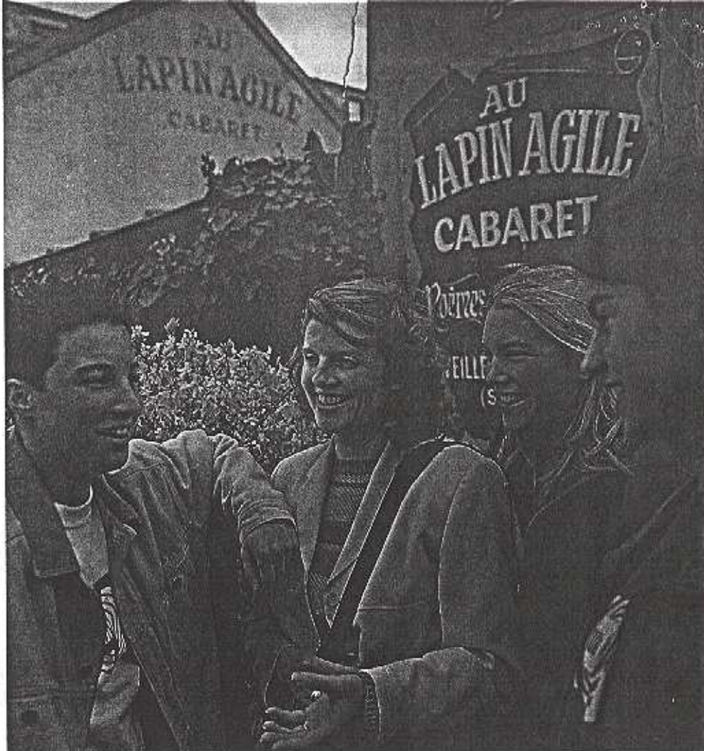
Parisian cabaret Au Lapin Agile was named for the building's painting of an agile rabbit.

Learn before you go www.ef-tours.com/pbsfrance www.ef-tours.com/pbsspain